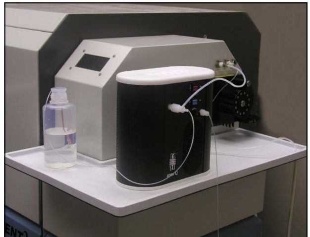
Greater work area makes using the Apex or other sample introduction systems more convenient.

Elemental Scientific Inc. 2440 Cuming St Omaha, NE 68131 USA www.elementalscientific.com