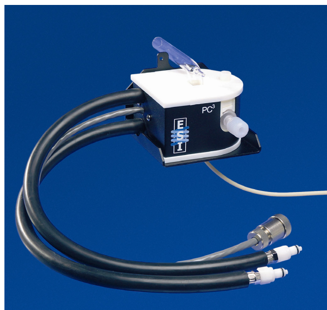
PC 3 Peltier-cooled cyclonic spray chamber for Agilent ICPMS.

The PC 3 is a compact Peltier Cooled inlet system which incorporates the ESI cyclonic spray chamber. The peltier within the PC 3 is water cooled, and installs easily, replacing the standard peltier cooled Scott spray chamber. The PC 3 reduces the water vapour loading on the plasma resulting in enhance stability and performance. The spray chamber can incorporate any 6 mm nebulizer and is ideally suited to the PFA-ST Microflow nebulizer.